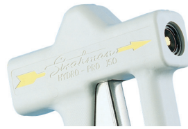
RUBBER COVER - WHITE