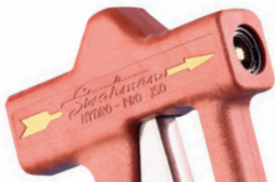
RUBBER COVER - RED