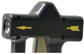
RUBBER COVER - BLACK